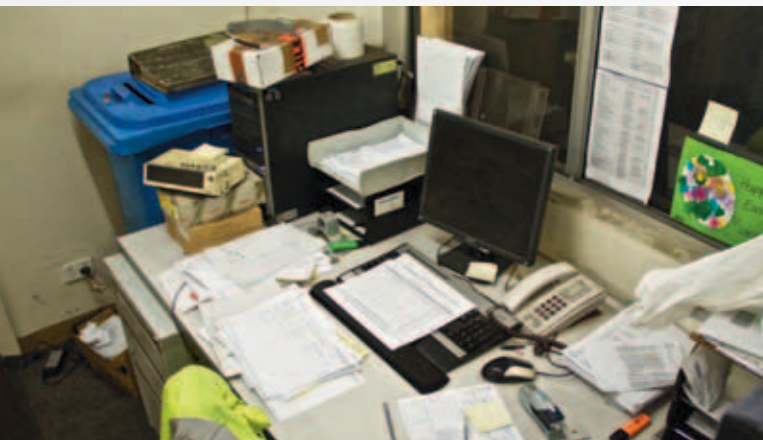
Turn over to see the 5S transformation in Troy's WH Desk